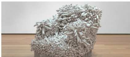
From the Collection: 1960-1969

There are three exhibitions I want you to look at. (You may, of course, also look at any other work in the museum.) The three exhibitions are: