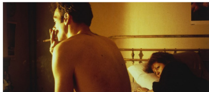
Nan Goldin: The Ballad of Sexual Dependency